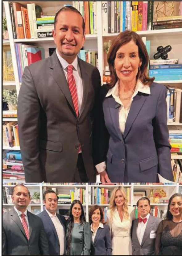
USA Hosted a reception for New York Governor Kathy Hochul alongside an amazing host committee. A wonderful evening of meaningful conversations, partnership, and bringing people together